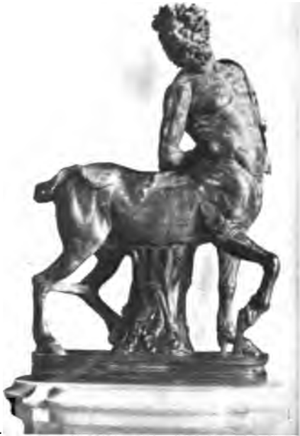
Fig. 85. Centaur.

attend. In crossing a river he lost one sandal in the mud and went on without it. Now Pelias had been warned by an oracle to beware of a